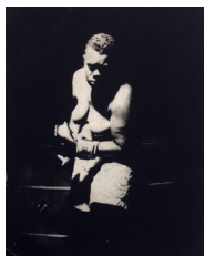
COURTNEY - THE UNSEEN BOXER 2, 2015

PHOTOGRAVURE ON YUKU-SHI JAPANESE PAPER PRINTED 2016.