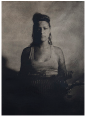
SELF PORTRAIT, 2015

PHOTOGRAVURE ON YUKU-SHI JAPANESE PAPER PRINTED 2016.