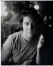
SELF PORTRAIT 2, 2015

PHOTOGRAVURE ON YUKU-SHI JAPANESE PAPER PRINTED 2016.