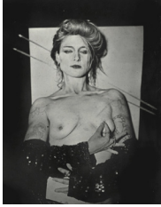
ZIBBY, 2015 PHOTOGRAVURE ON YUKU-SHI JAPANESE PAPER PRINTED 2016. 25 1/2 x 19 3/4 IN. SIGNED & NUMBERED 1/15 AU RECTO. $750 UNFRAMED